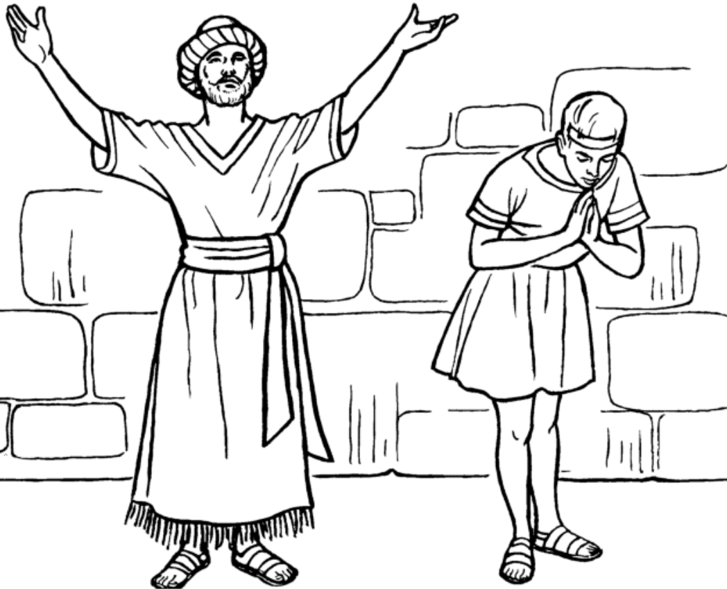
The Parable of The Faithful Servant

Coloring & Activity Pages by: Bible-Printables.com